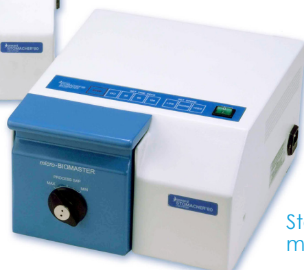
Stomacher® 80 microBiomaster