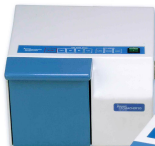
Stomacher® 80 Biomaster